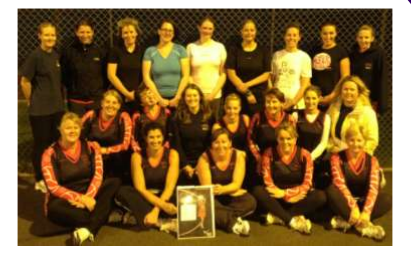
Back to Netball Tournaments

The first of a series of Back to Netball Tournaments hosted by Lincolnshire Netball has taken place. Lincolnshire added the competition to their County League as an exit route and introduction to match play for ladies participating in Back to Netball schemes. Five tournaments will take place with points rolling over to the next round. Teams will be presented with awards at the Lincolnshire County Presentation Evening in April 2013 at the Epic Centre.