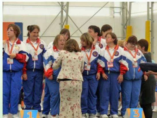
East Midlands Team receiving their bronze medal

In netball, four senior teams (Scotland West, North West, Fife, East Midlands) and three junior teams (Northern, Southern, Scotland West) took part in netball activity and competed in the Special Olympic Netball Competition. Results - Gold Medal - Scotland West, Silver Medal - North West and Bronze medal - East Midlands, 4th place - Fife.