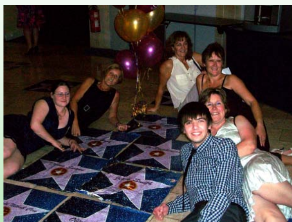
East Midlands nominees with their Hollywood stars