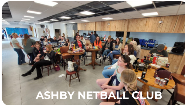
ASHBY NETBALL CLUB