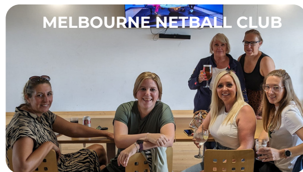
MELBOURNE NETBALL CLUB