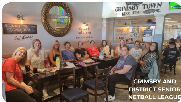
GRIMSBY AND DISTRICT SENIOR NETBALL LEAGUE