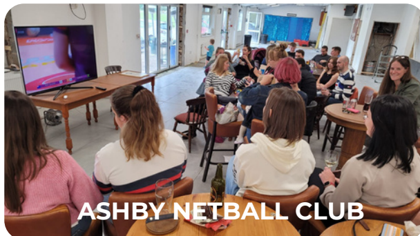
ASHBY NETBALL CLUB