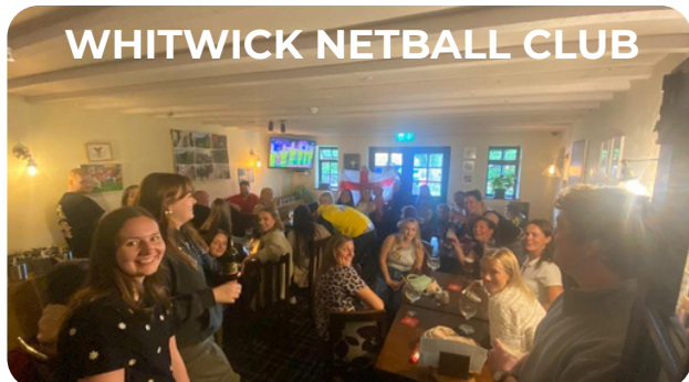
WHITWICK NETBALL CLUB