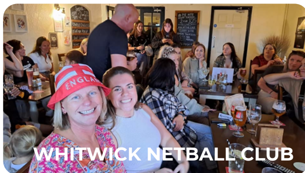
WHITWICK NETBALL CLUB