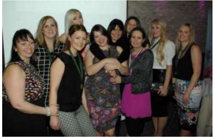
Willow Whirlwinds— Most Improved Team of the Year