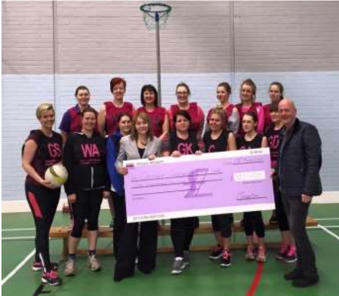
Shepshed Netball Amateur Players