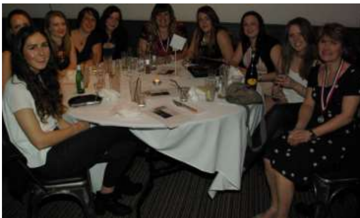
Flights—Winners of Division 2