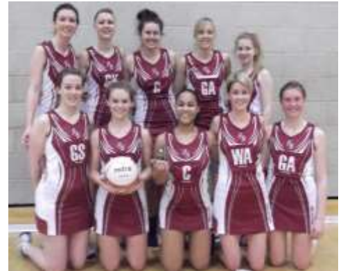
Div 1 Winners- Southgate

Bridgford 24 - 25 Brigg 2 Pennine 20 - 19 Ripley Bridgford 22 - 14 Pennine Brigg 2 21 - 21 Ripley Brigg 2 20 - 19 Pennine Ripley 18 - 23 Bridgford