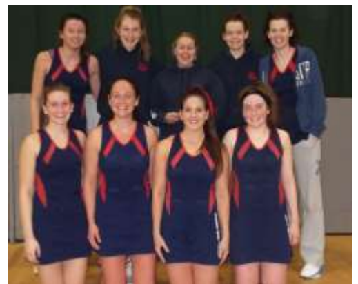
Div 2 Winners- Sleaford Barge 1