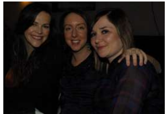
Southbank Netball Club