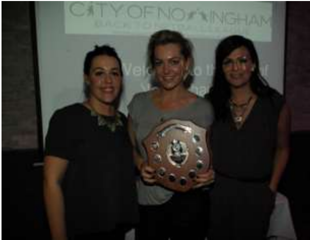
Stealers—Winners of Division 1