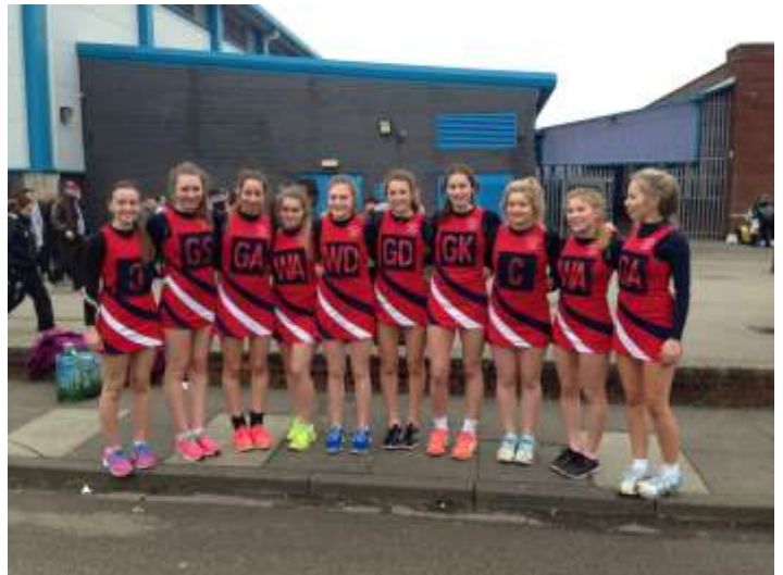
Loughborough High School