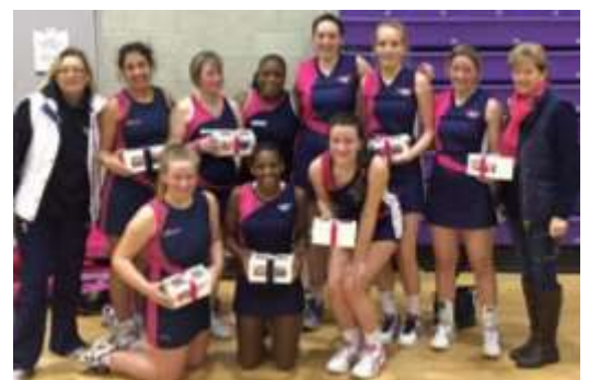
Div 3 Winners- Northants JMs