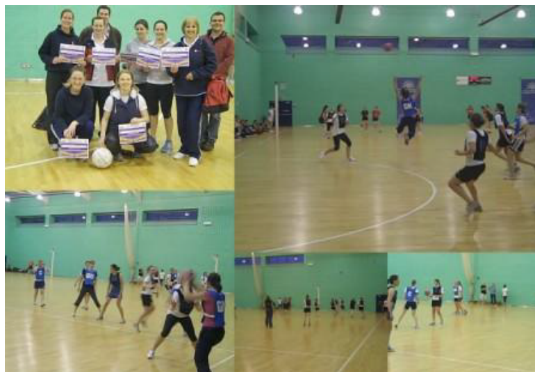
Action from the Workplace Challenge

A big thanks goes to Loughborough Town Netball League for organising the event.