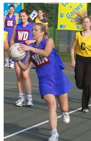
Photo's from the 2010 Corporate Games